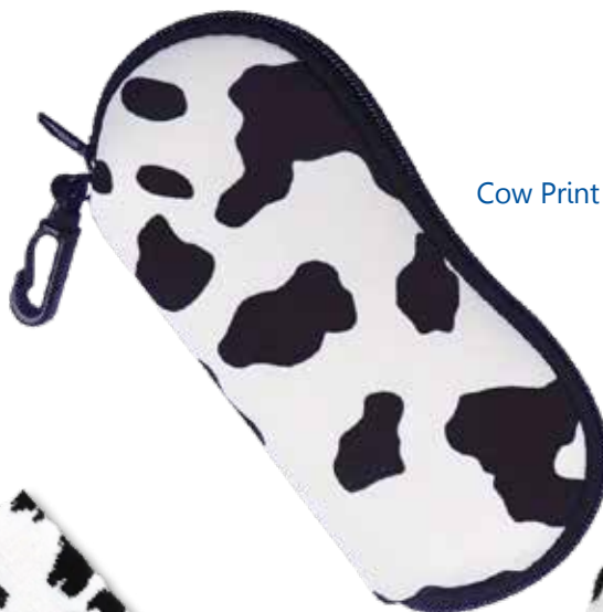
WSEG2 Cow Print Zipper Glasses Case $4.98