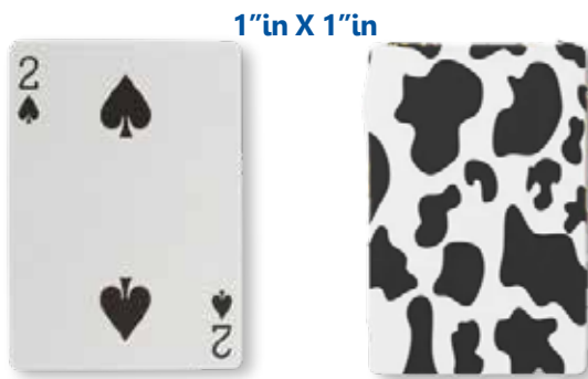
1" in X 1" in