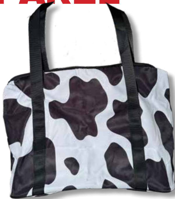
WSBA18 Cow Print Duffle bag $12.48