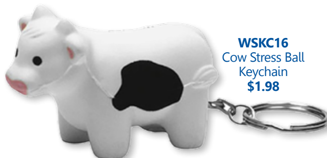
WSKC16 Cow Stress Ball Keychain $1.98