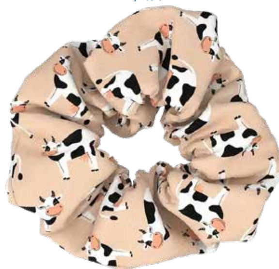
WSAC24 Cow Scrunchie Pink $1.98