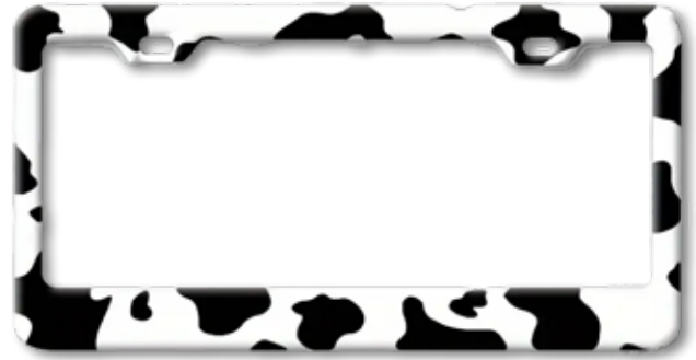
WSVH1 Cow Print License Plate Frame $6.98