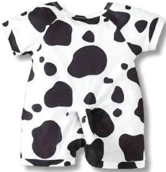
WSAP18S Cow Print w/Tail Onesie $8.48