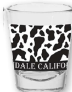
WSDW2 Ferndale/California Cow Print Shot Glass 1.75oz $2.98