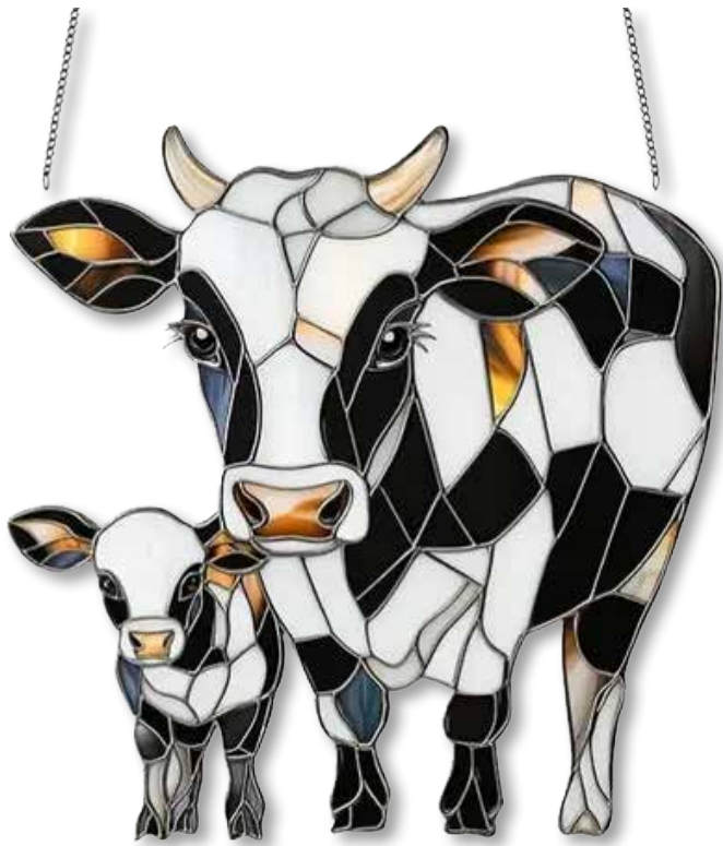
WST02 Cow Suncatcher 6"X8" $7.98