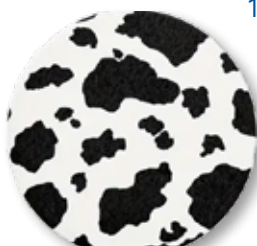
WSCO2 Rubber Cow Print Coaster 3.5" $1.98