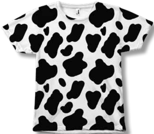
WSAP2L Women's Cow Print T-Shirt $11.98