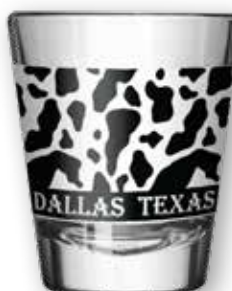
TXDW3 Dallas Cow Print Shot Glass 1.75oz $2.98