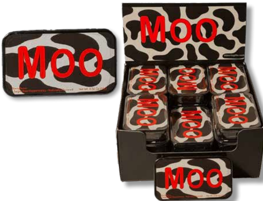
WSMN1 (24 Pack) Cow Print Mints $47.52