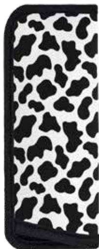
WSEG1 Cow Print Glasses Case $5.98