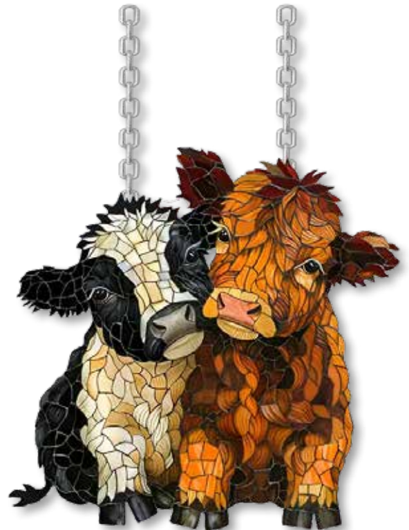
WST02 Cow Suncatcher 6"X8" $7.98