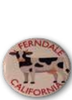
WSMG1 1.25" Magnet $1.00