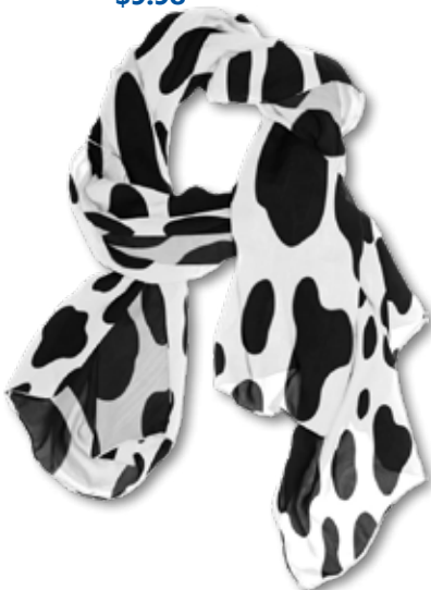
WSSF1 Cow Print Scarf $7.98