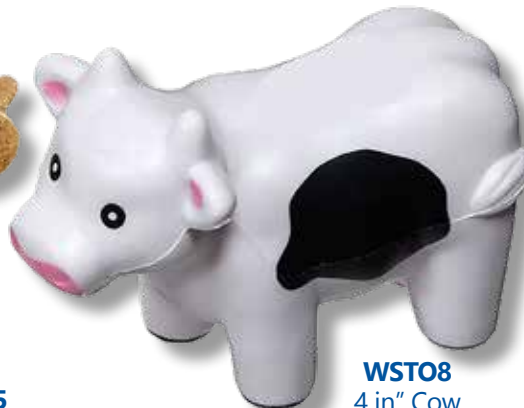
WSTO8 4 in" Cow Stress Ball $2.98