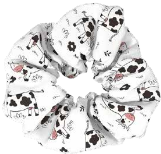
WSAC23 Cow Print w/ Cow Scrunchie White $1.98