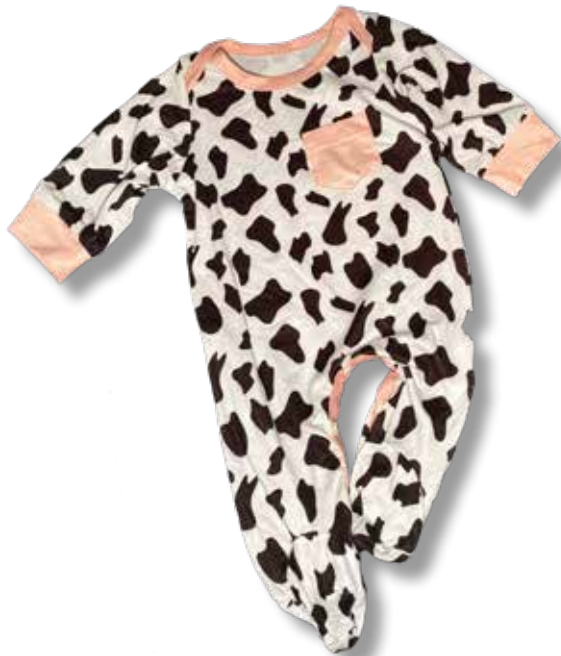
WSAP16S Cow Print w/ Pink Onesie $8.48