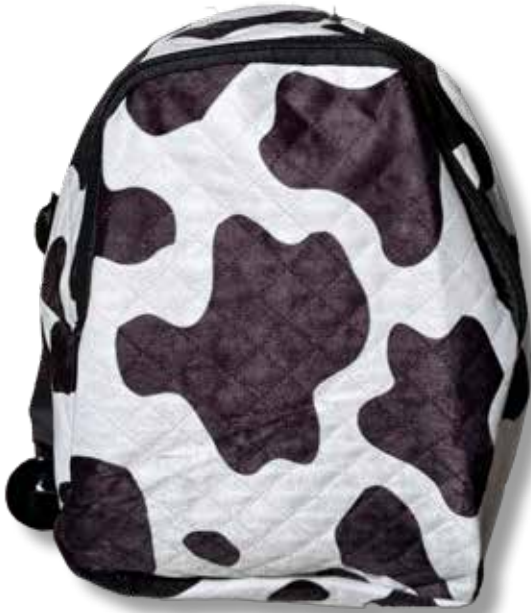
WSBA17 Cow Print Quilt Backpack $14.98