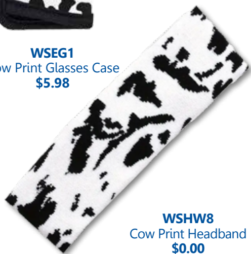
WSHW8 Cow Print Headband $0.00