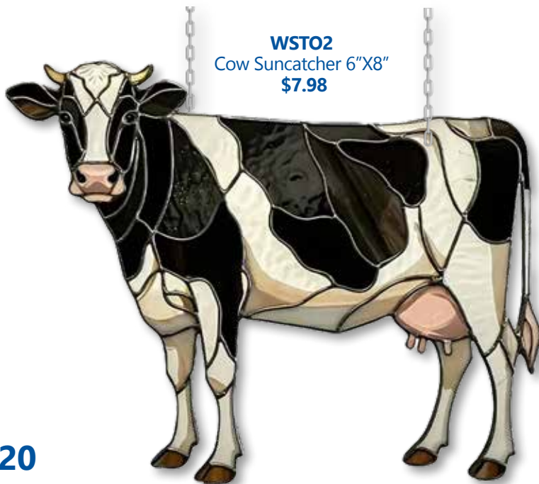
WST02 Cow Suncatcher 6"X8" $7.98