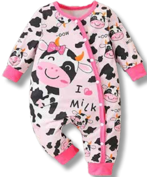
WSAP14S Cow Print "I Love Milk" Onesie $8.48