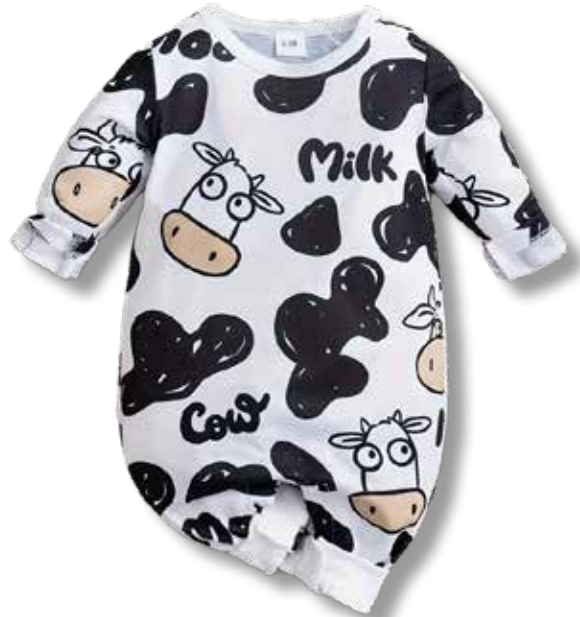
WSAP19S Cow Print w/ Heads Onesie $8.48