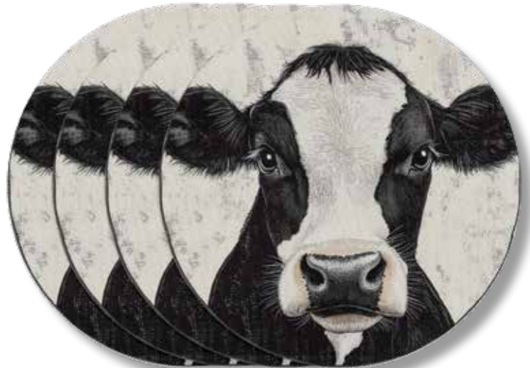
WSHG3 Cow Dinner PlaceMats (4 Pack) $9.92