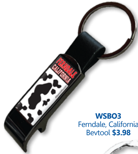
WSBO3 Ferndale, California Bevtool $3.98