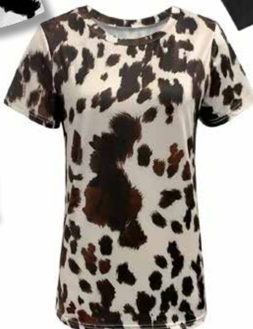
WSAP2 Women's Cow Print Tee $11.98