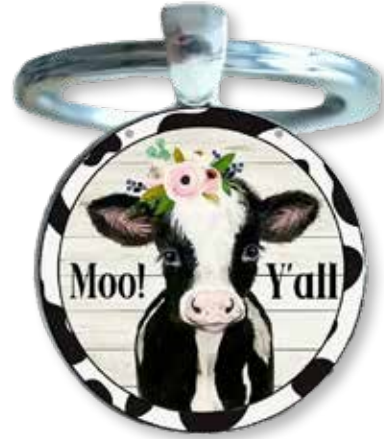
WSKC17 Moo! Y'all! Keychain $2.98