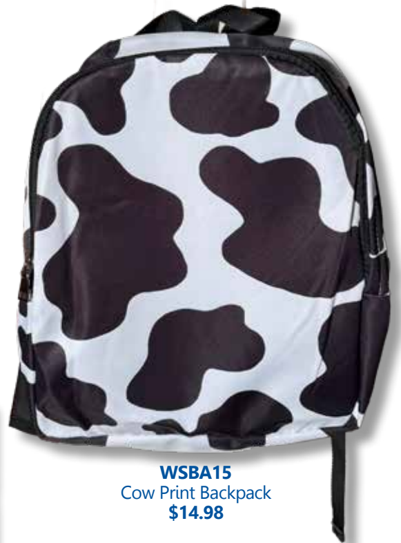
WSBA15 Cow Print Backpack $14.98