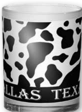
TXDW2 Dallas Cow Print Rocks Tumbler 14oz $9.98