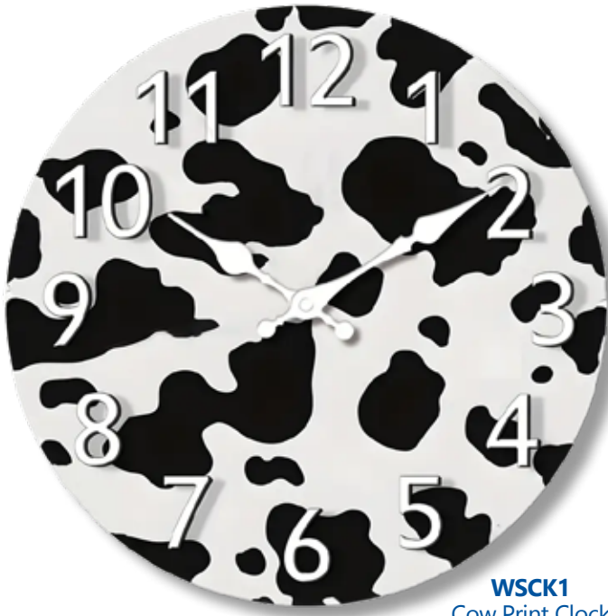
WSCK1 Cow Print Clock $13.98