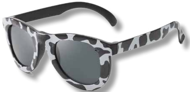
WSEG3 Cow Print Glasses (Childrens) $2.48