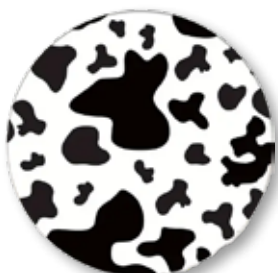
WSCO1 Wood Cow Print Coaster 4" $1.98