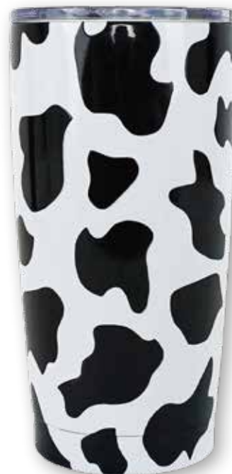
NODW92 Cow Print Travel Tumbler 16oz $6.48