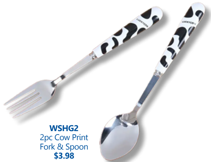
WSHG2 2pc Cow Print Fork & Spoon $3.98