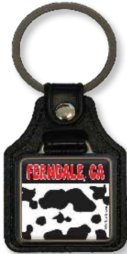
WSKC15 Ferndale, California Keychain $2.98