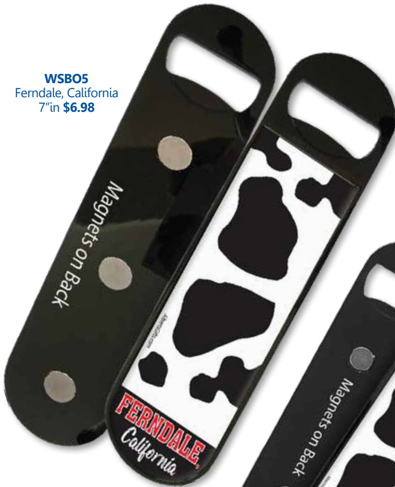
WSBO5 Ferndale, California 7" in $6.98