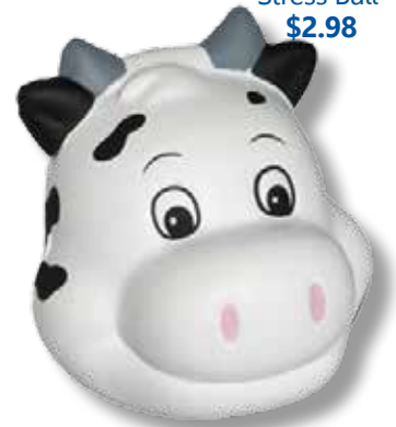
WSTO10 4 in" Cow Head Stress Ball $2.98