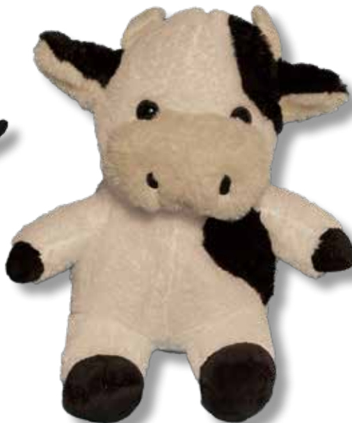
WSTO1 9 in" Cow Plush $5.98