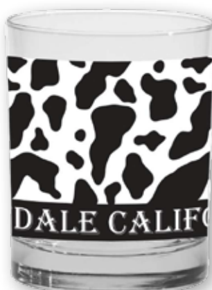
TXDW4 Ferndale/California Cow Print Rocks Tumbler 14oz $9.98