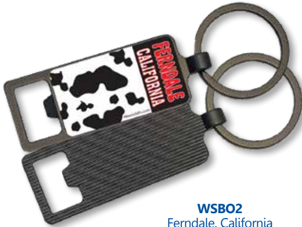
WSBO2 Ferndale, California Bottle Opener $3.48