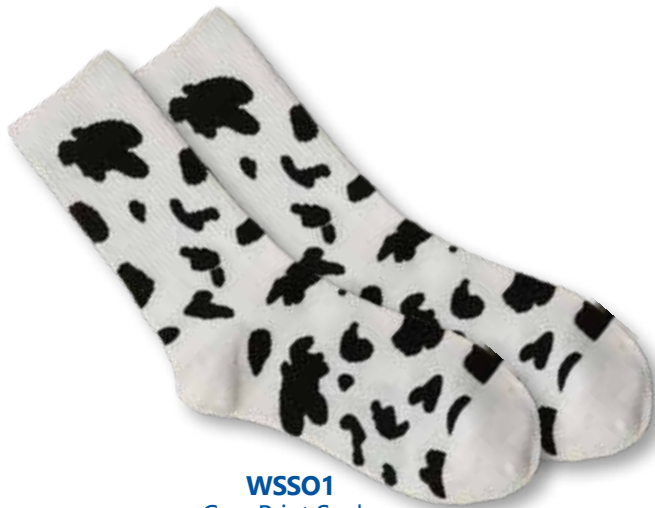
WSS01 Cow Print Socks $3.98