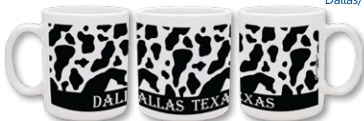
TXDW1 Dallas/Texas Cow Print Mug 11oz $4.98