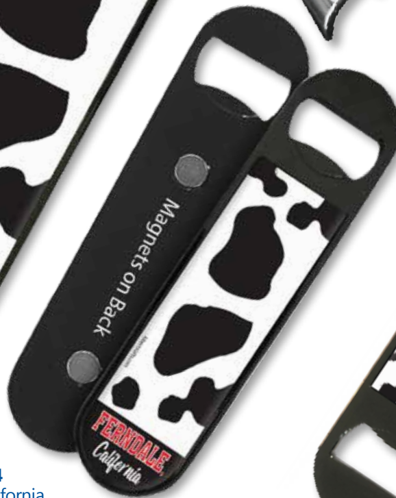
WSBO4 Ferndale, California 5" in $4.25