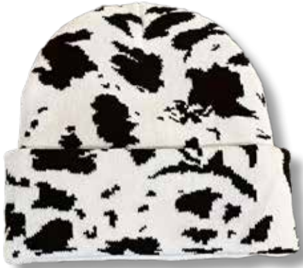
WSHW7 Cow Print Winter Hat $7.48