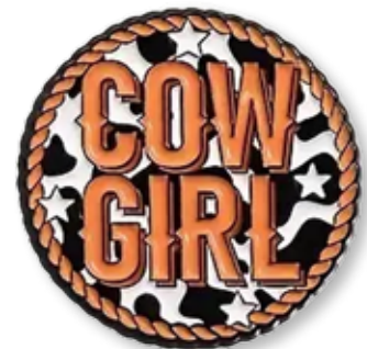
WSP112 Cow Girl Pin $1.98