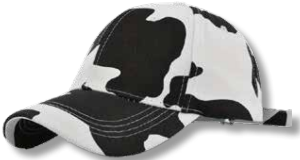
WSHW2 Cow Print Billed Cap $9.98