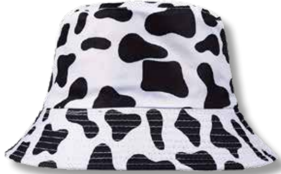
WSHW1 Cow Print Bucket Hat $6.98