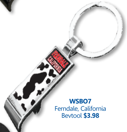
WSBO7 Ferndale, California Bevtool $3.98