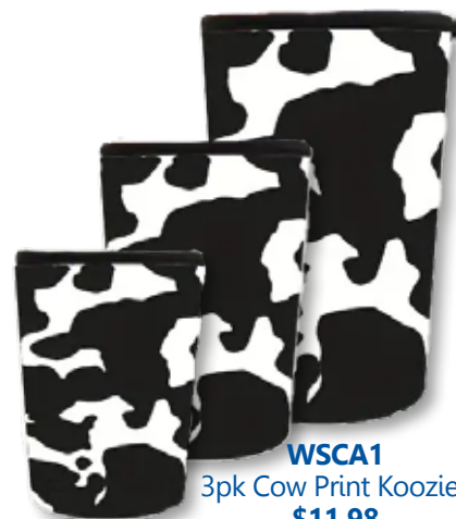
WSCA1 3pk Cow Print Koozies $11.98