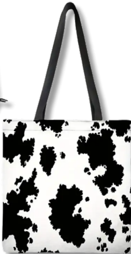
WSBA14 Cow Print Tote Bag $7.98