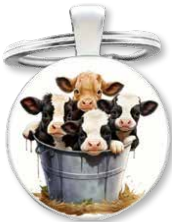
WSKC18 Cow Bucket Keychain $2.98