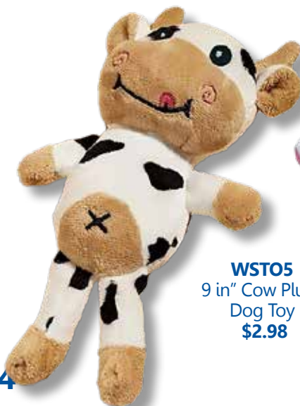
WSTO5 9 in" Cow Plush Dog Toy $2.98