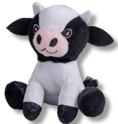
WSTO11 4.5 in" Cow Plush $2.48