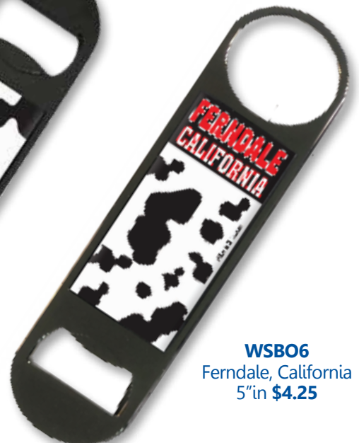
WSBO6 Ferndale, California 5" in $4.25