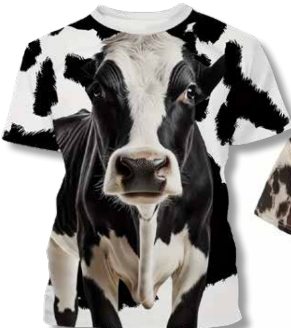
WSAP21S Men's Cow Print w/ COW T-Shirt $11.98