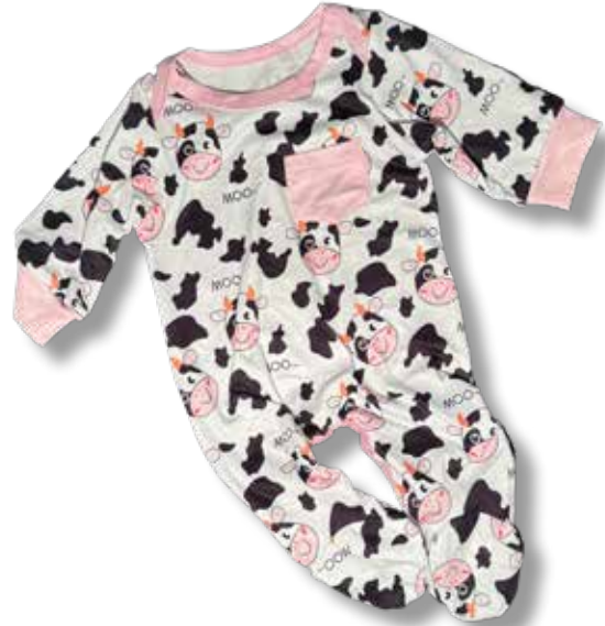
WSAP15S Cow Print Pink w/ Faces Onesie $8.48