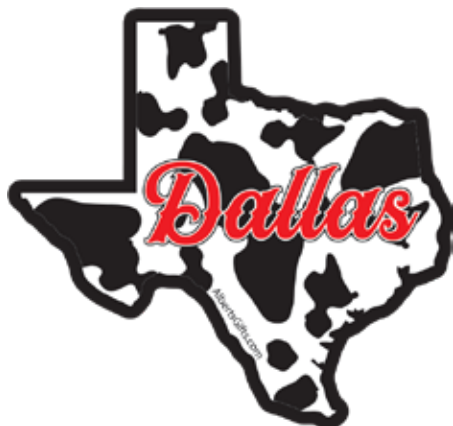
TXMG4 Cow Print State / Dallas Magnet 4" $1.48