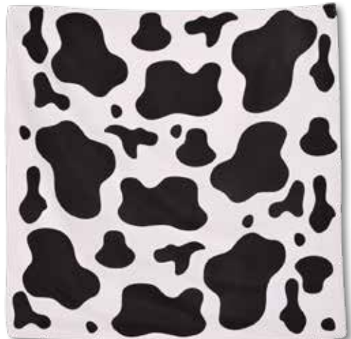
WSAC39 Cow Print Bandana $2.48