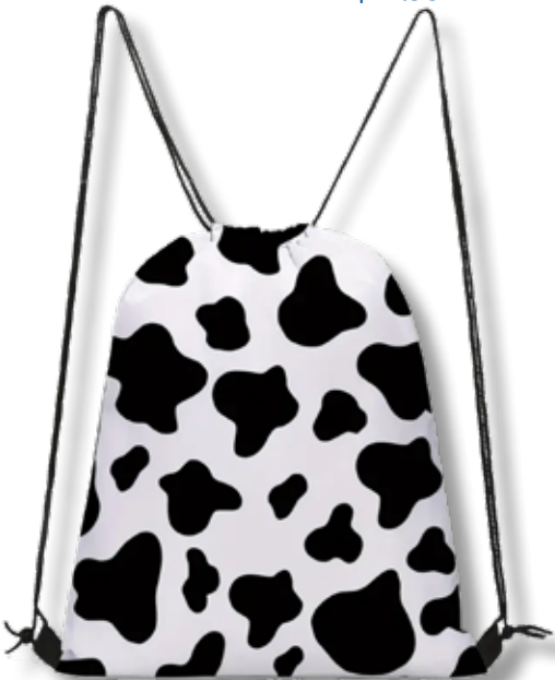
WSBA16 Cow Print Drawstring Bag $4.98