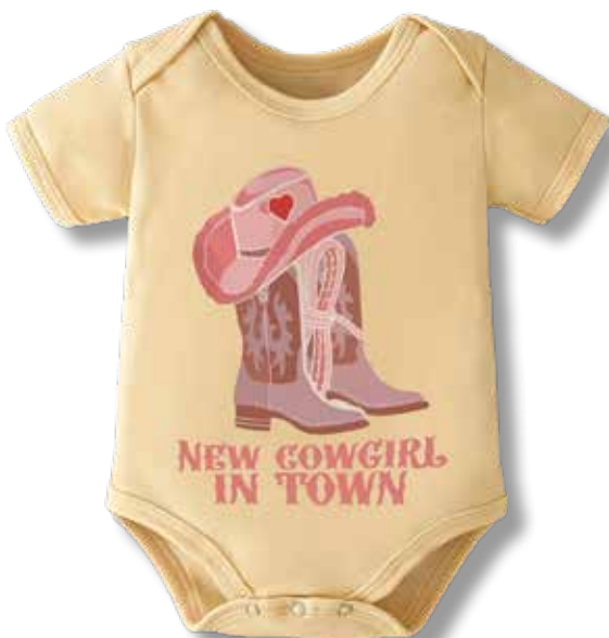
WSAP22S New Cow Girl In Town Onesie $8.48