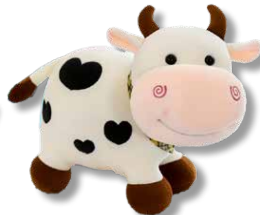
WSTO13 11" in Cow Plush $8.48