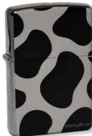
WSAC41 Cow Print Flip Lighter $6.48