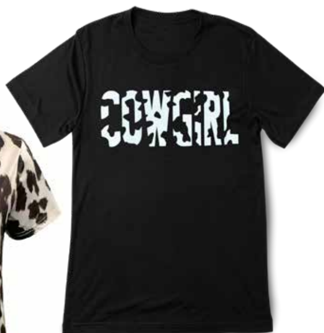
WSAP25 Women's Cowgirl T-Shirt $11.98