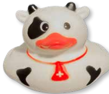
WSTO3 Cow Jeep Duck $0.98