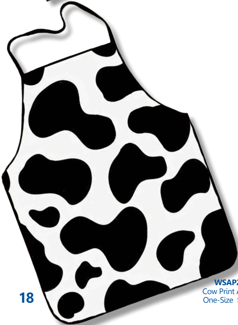
WSAP20 Cow Print Apron One-Size $6.98