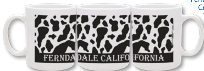
WSDW3 Ferndale/California Cow Print Mug 11oz $4.98