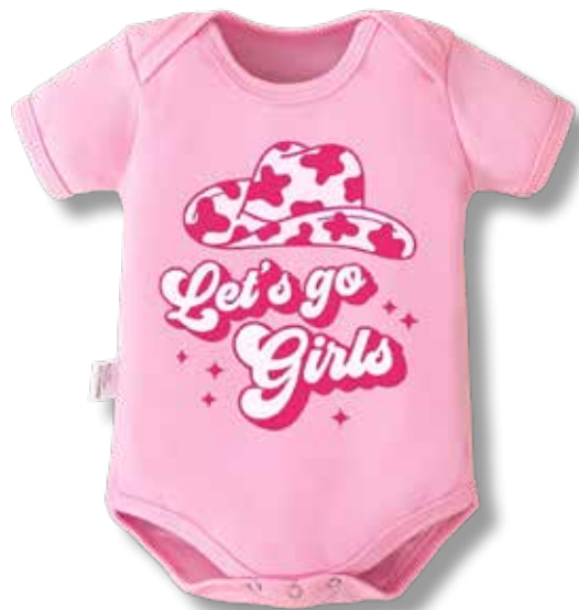
WSAP23S Lets Go Girls Pink Onesie $8.48