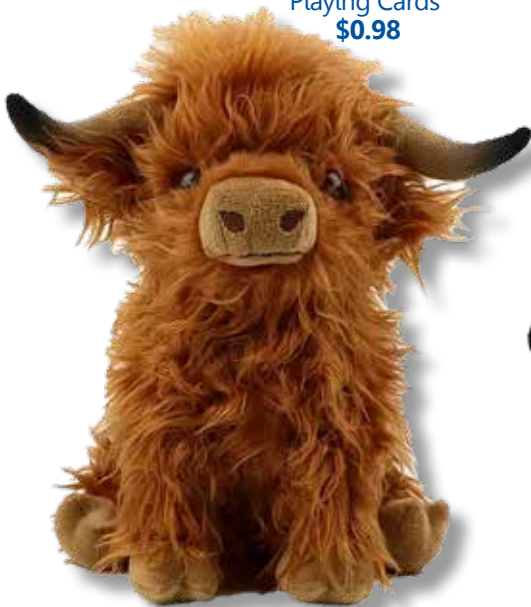
WSTO6 10 in" Highland Cow Plush $9.98