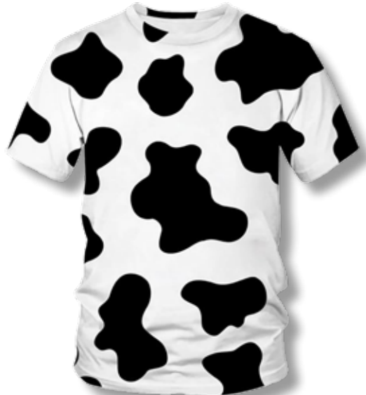
WSAP3XL Men's Cow Print T-Shirt $11.98