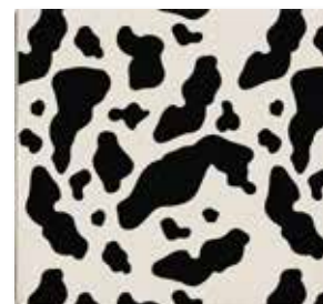
WSCO3 Stone Cow Print Coaster 4" $4.98