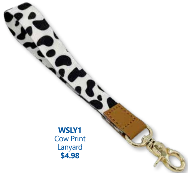
WSLY1 Cow Print Lanyard $4.98