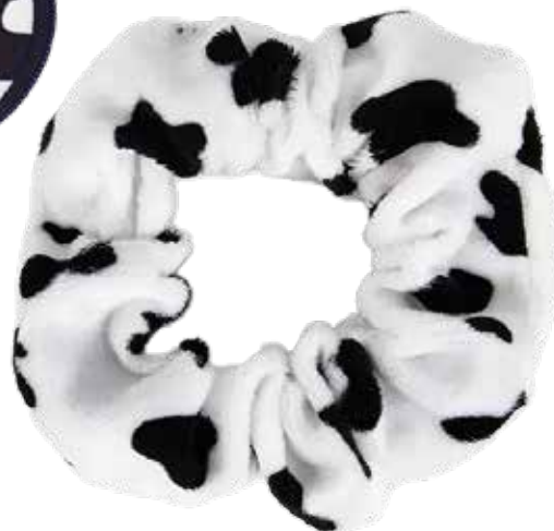
WSAC22 Cow Print Scrunchie $1.98