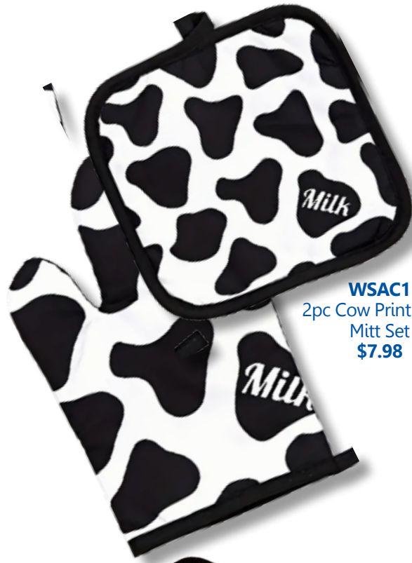
WSAC1 2pc Cow Print Oven Mitt Set $7.98