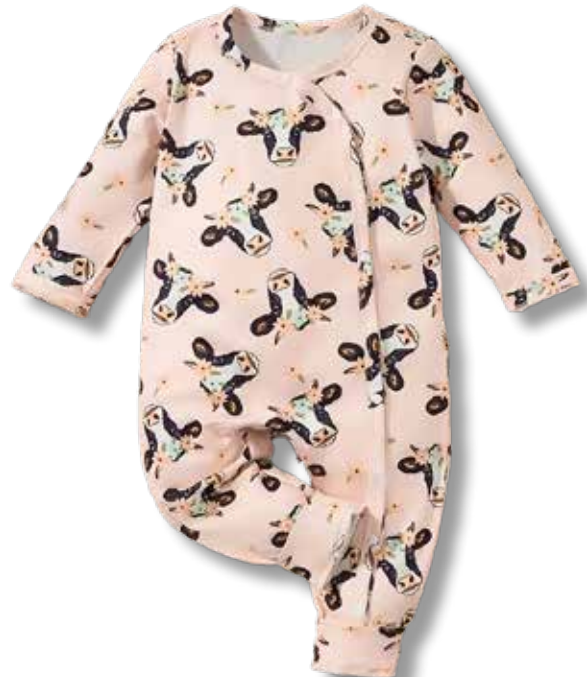
WSAP17S Cow Heads Pink Onesie $8.48